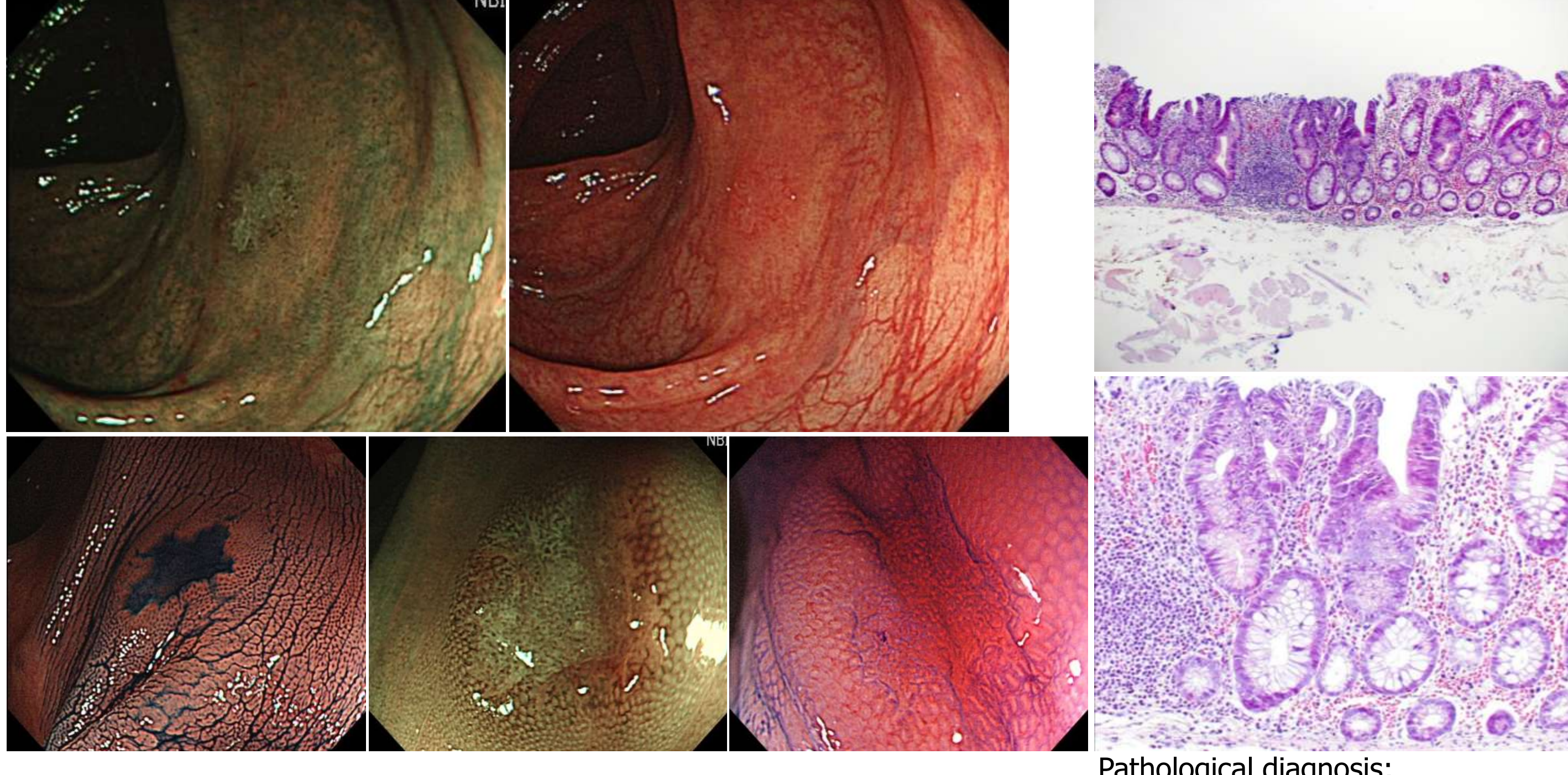
Pathological diagnosis; Tubular adenoma with severe atypia.

This depressed lesion (Type IIc) was detected by colonoscopy with NBI system.